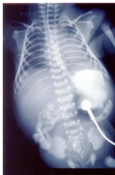
Fig. 3 Upper gastrointestinal study: distended stomach with normal gastric contour and duodenal cap