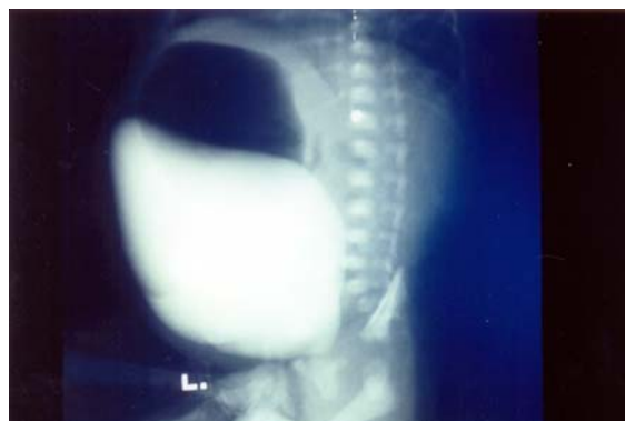
Fig. 2 Voiding cystoureterography: markedly distended urinary bladder