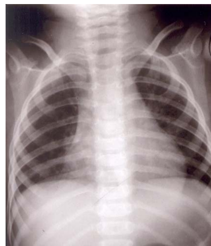
Fig. 3 Chest radiograph at 1 year after completion of treatment showing completion resolution of infiltrates