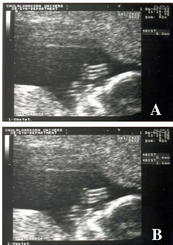
Fig. 1 Ultrasonographic measurements of diameters of umbilical cord (A) and umbilical vessels (B) in first trimester